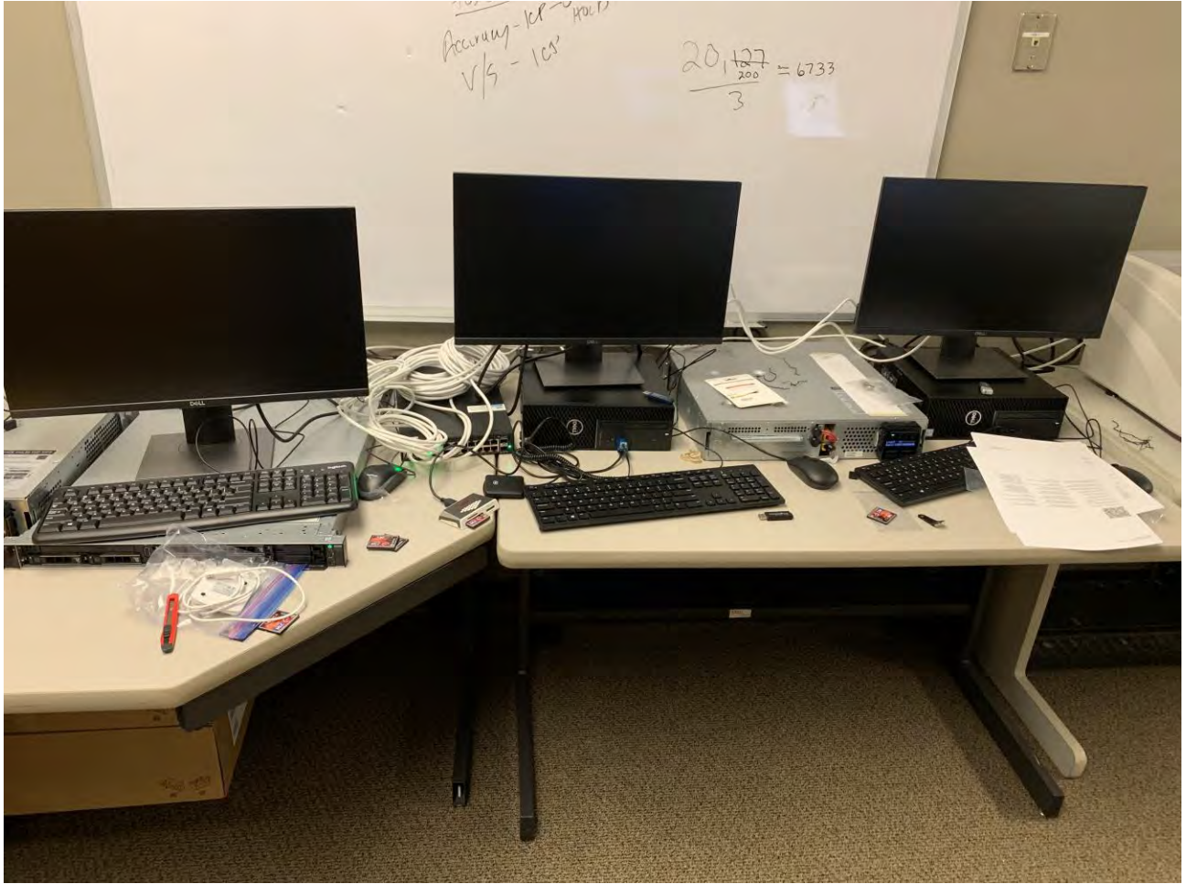
Photograph 2: EMS Standard Configuration