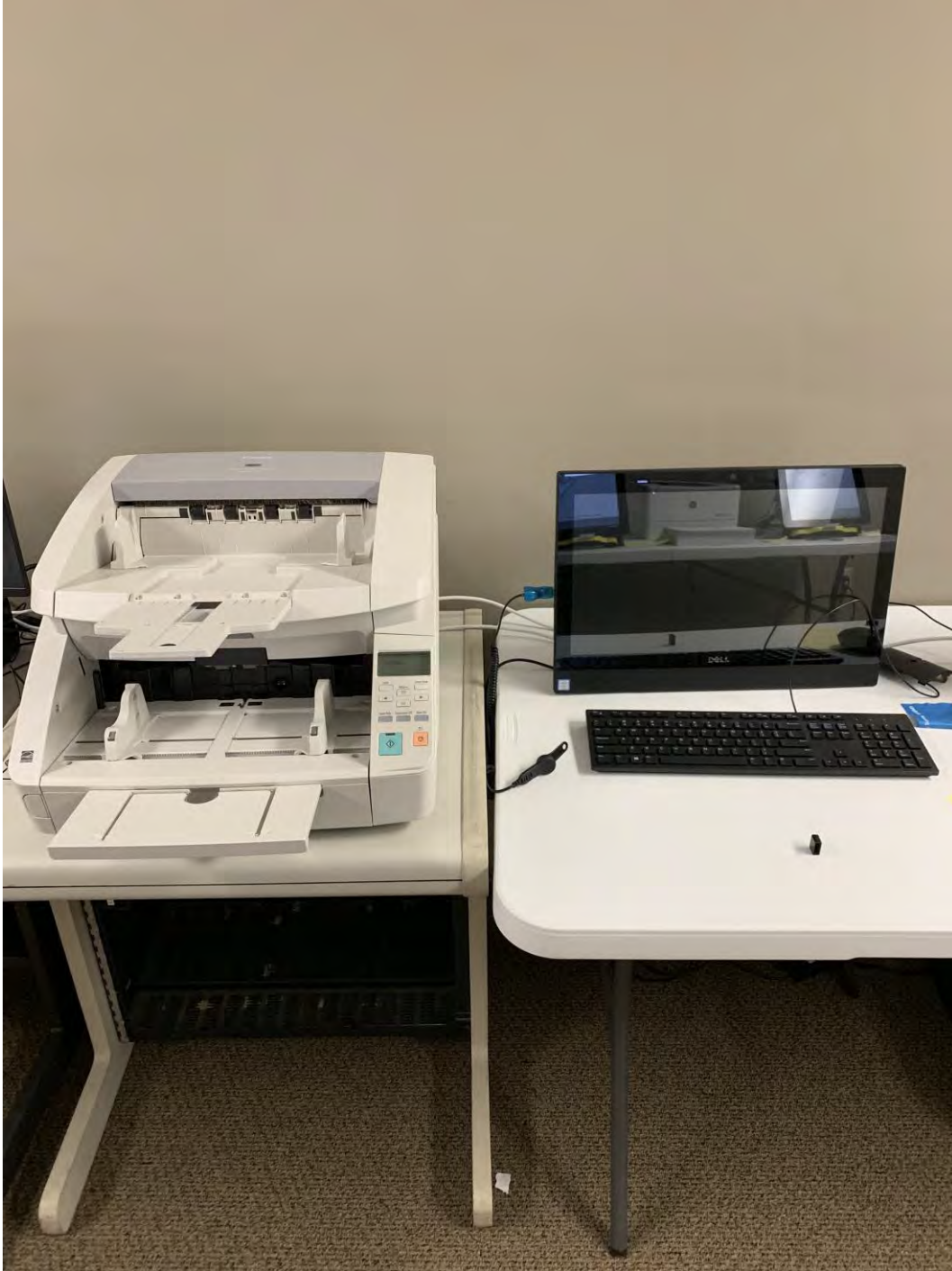
Photograph 3: ICC Workstation with Canon DR-G1130