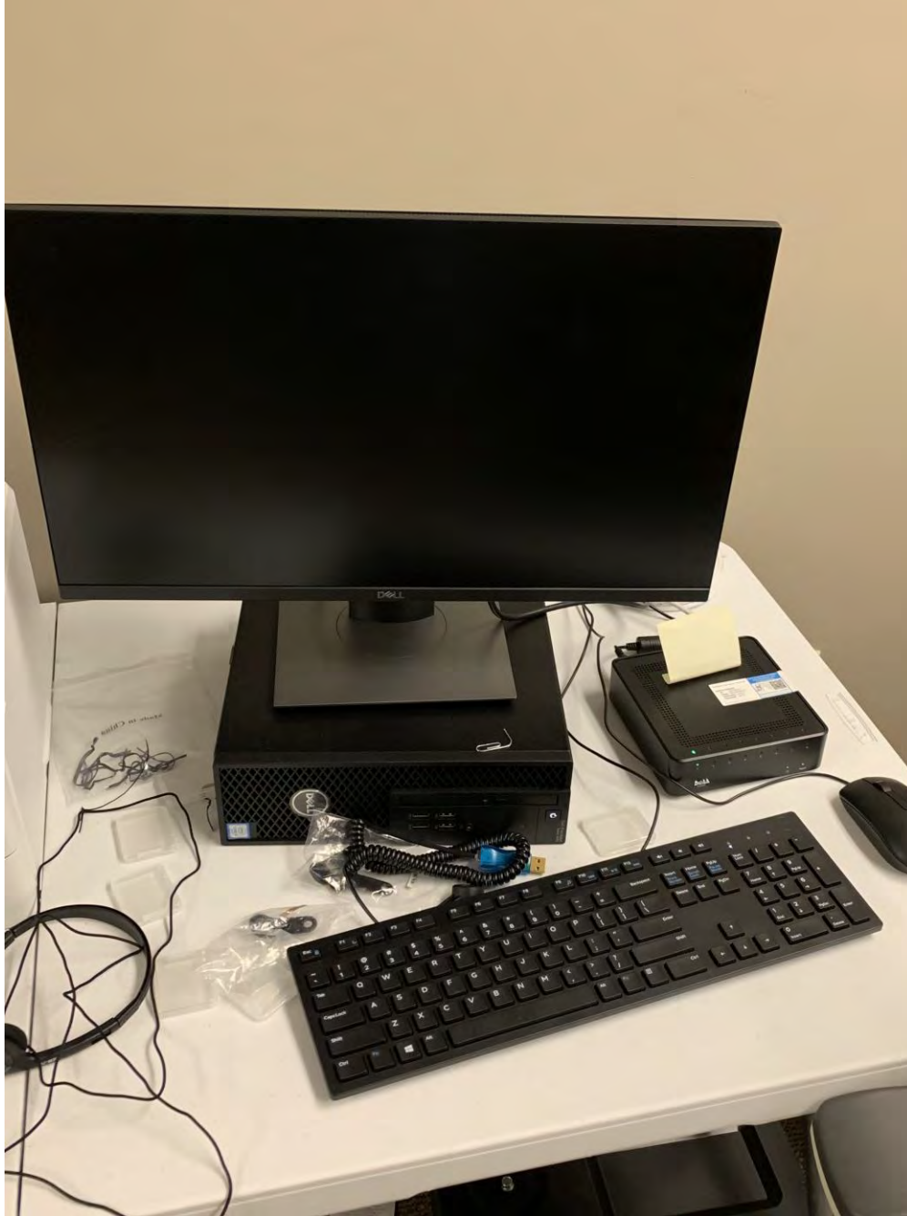
Photograph 1: EMS Express Configuration