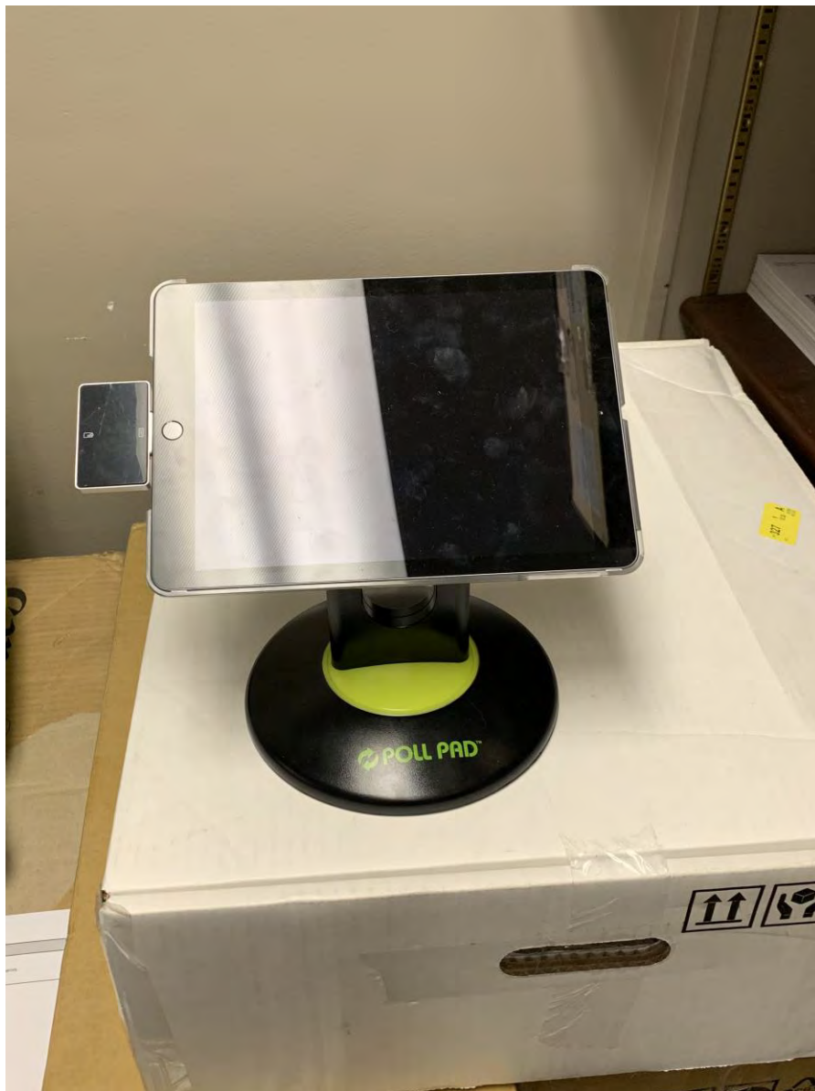
Photograph 6: ePollbok

A pre-certification election was then loaded and an Operational Status Check was performed to verify satisfactory system operation. The Operational Status Check consisted of processing ballots and verifying the results obtained against known expected results from pre-determined marking patterns.