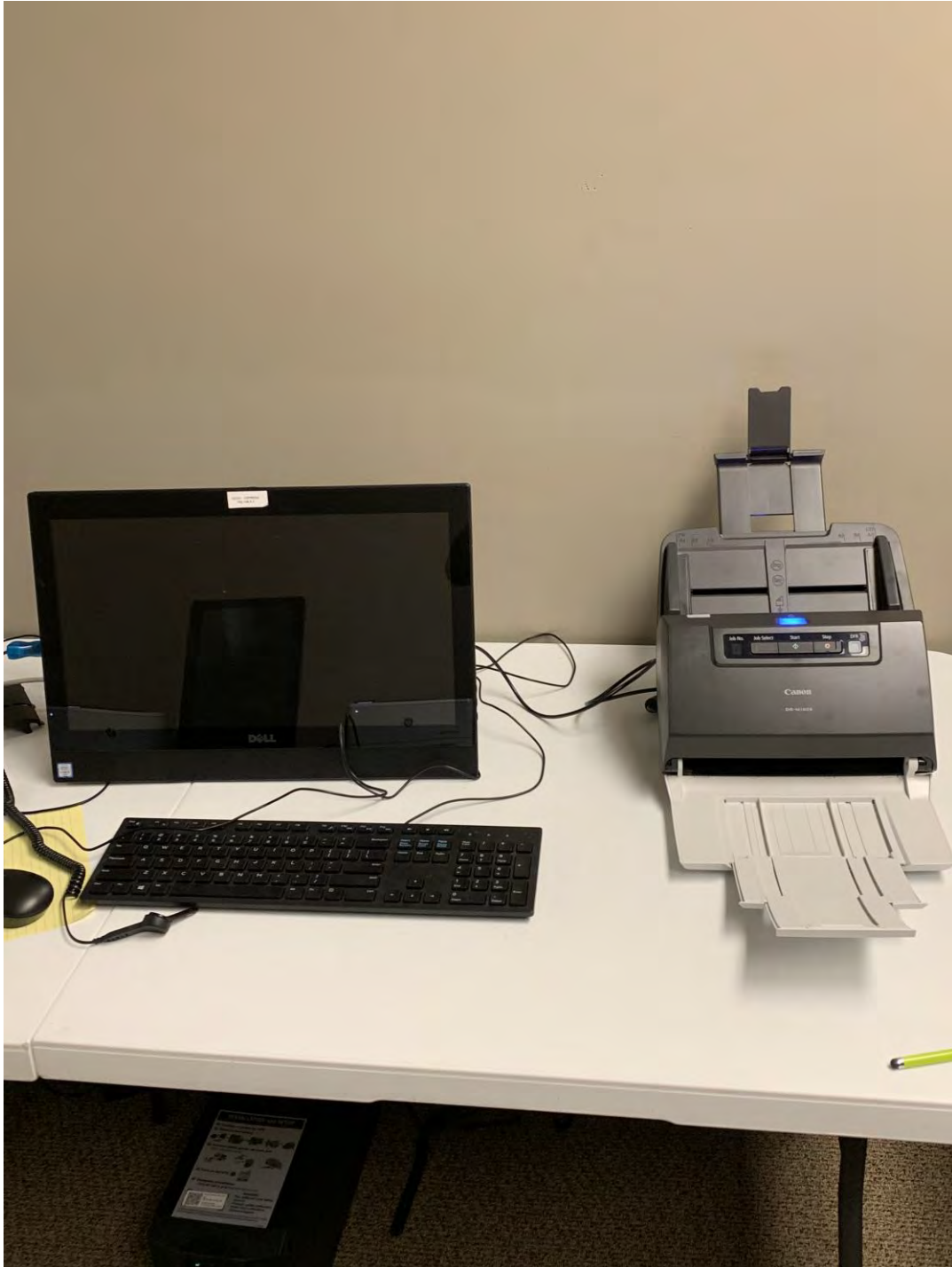
Photograph 4: ICC Workstation with Canon DR-M160II